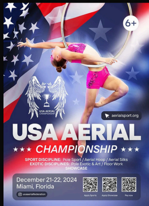
USA AERIAL CHAMPIONSHIP

TO BE AN EXHIBITOR FOR 2 EVENTS DEC 21-22 400$